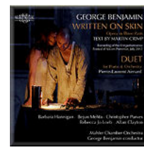
Benjamin: Written on Skin £1