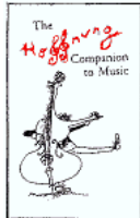
Companion to Music