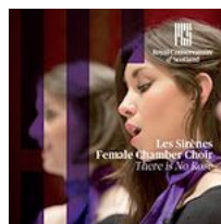
There is no Rose £12 post free World-wide