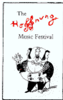
Hoffnung Music Festival